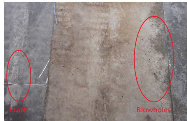
Figure 3. Achieved concrete for competing product (left), without formliner (middle) and Formtex® (right).

The concrete cast with the competing CPF-liners appeared smooth but with some cracks. The concrete cast without using formliner appeared rough and with many blowholes. Concrete with Formtex® appeared smooth and dense. On the basis of these results and consecutive testing at an independent test laboratory, Formtex® was selected for the Container Terminal No. 9 project.