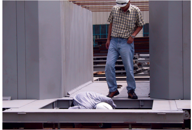
Figure 5. The formwork for the huge beams is inspected.