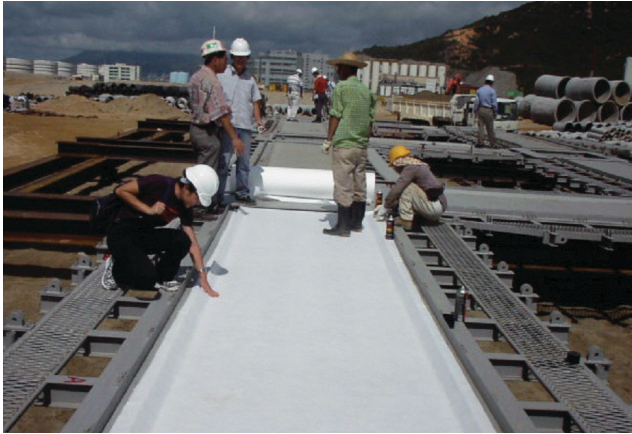
Figure 4. Formtex® is glued to the formwork (bottom).