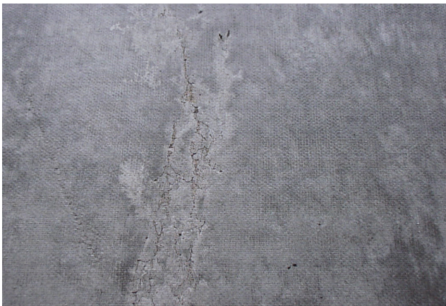
Figure 6. A large crack in the surface of the test of the competing product.