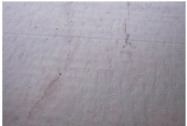
Figure 7. Several cracks in the surface of the test of the competing product.