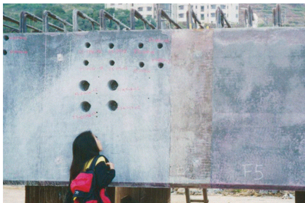
Figure 2. The trial beam, with the competing product (left), without formliner (middle) and Formtex® (right).

The contractor, Hyundai, carried out a trial in November 2001 to determine the effect of different CPF liners. Formtex® was glued to the same metal formwork as the competing products, and the liners were tested in the same casting, so they had exactly the same performance conditions.