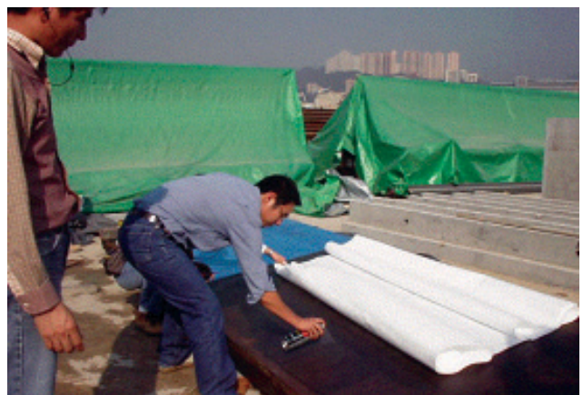
Figure 9. Test formwork is prepared with the competing product on the left and Formtex® on the right.