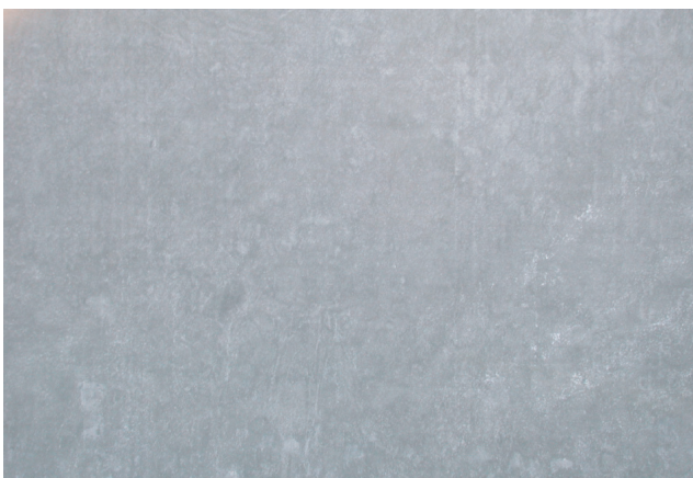
Figure 8. Surface achieved with Formtex®.